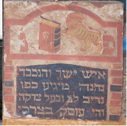
Rare Colored Jewish Headstone ( Matseiva ) Unearthed in Kałuszyn in Recent Years