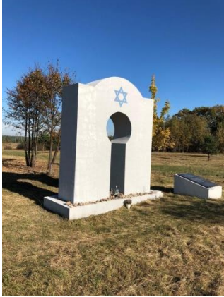
Existing Memorial Kałuszyn Cemetery