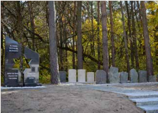
Siedliszcze cemetery memorial