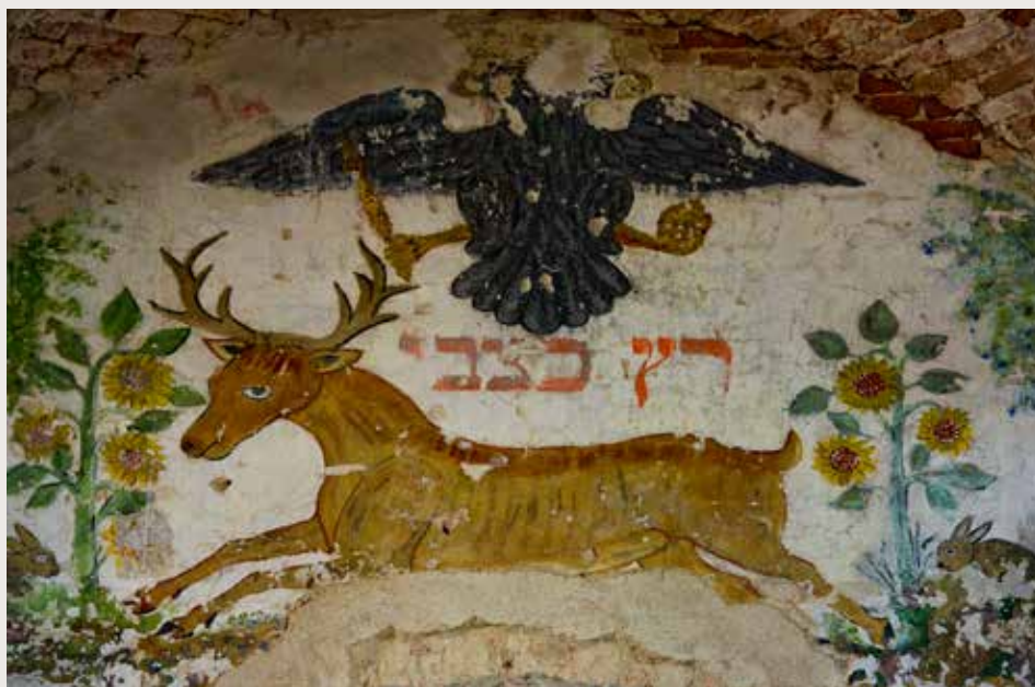
Orla synagogue interior

FRIENDS OF JEWISH HERITAGE IN POLAND uses less than 10% of donations for administrative purposes (such as mailing costs, transfer and bank fees). Per US legal requirements, regardless of funding sources, decisions on allocations are made by the Board of Directors of FJHP, which retains all rights for using the funds for charitable, scientific, or educational purposes.