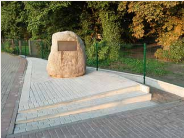
Kolo memorial stone